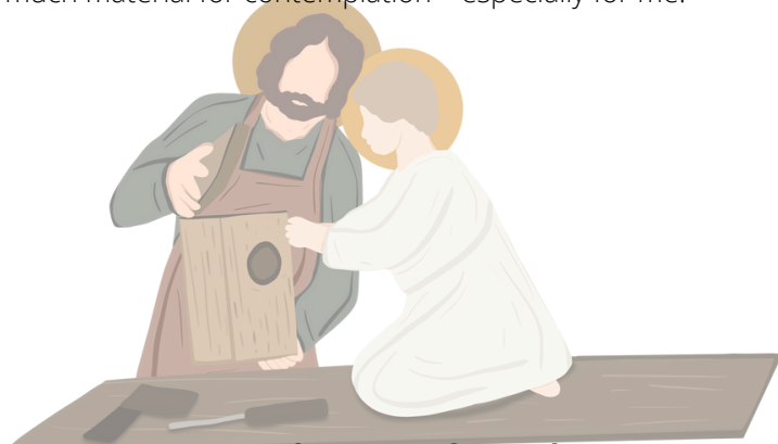
St Joseph, Prayer for Fathers

This Father's Day as we celebrate our dads, grandpas, pops and those who are like father too us, you may like to consider St Joseph in your prayers. Interestingly, St Joseph doesn't speak even once in the Bible. That point provides much material for contemplation – especially for me!