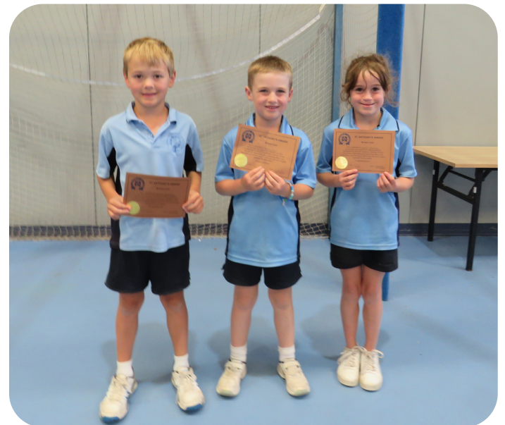
Congratulations to the first Principal's Award recipients for 2024.